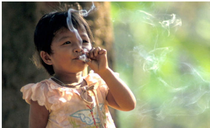
A young girl smoking.