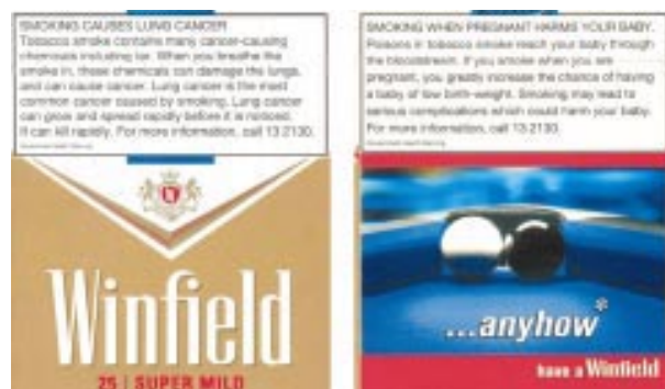
Figure 2 Winfield 25 Super Mild packs—back of a regular pack (left) and back of a pack with advertising image (right).

“Cigarettes, like all other packaged consumer goods, bear trademarks. A trade mark can be a colour, a series of colours, a device, a word, or a combination of any of them. A trade mark is a primary means by which information is imparted to the consumer. It is a means by which one product is distinguished from a multiplicity of competing products (each with its own trade marks) and is a normal marketing tool to retain or expand market share. By performing this function, trade marks become valuable assets protected by law from infringement or imitation.” 13