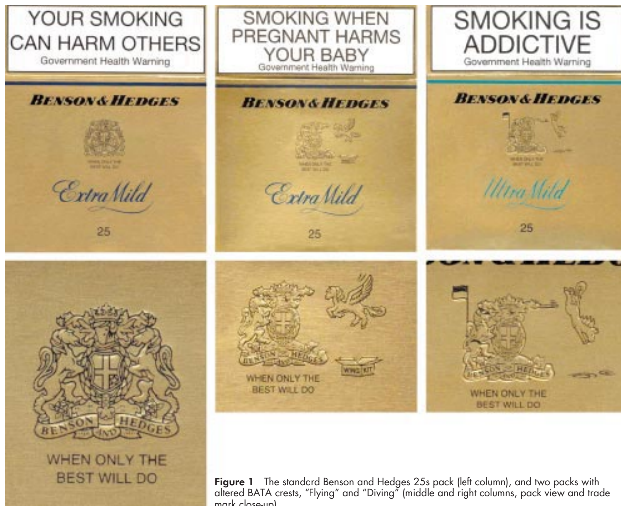
Figure 1 The standard Benson and Hedges 25s pack (left column), and two packs with altered BATA crests, “Flying” and “Diving” (middle and right columns, pack view and trade mark close-up).