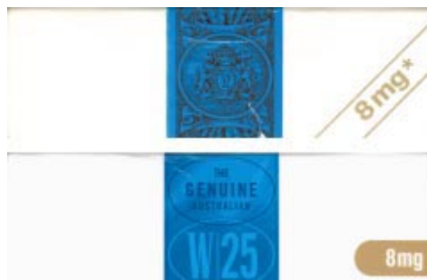
Figure 3 Winfield Super Mild 25’s—regular top of pack (top) and modified top of pack (bottom).