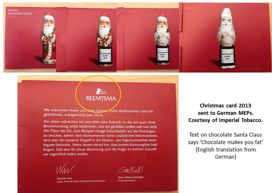
Christmas card 2013 sent to German MEPs.

Text on chocolate Santa Claus says 'Chocolate makes you fat' (English translation from German)