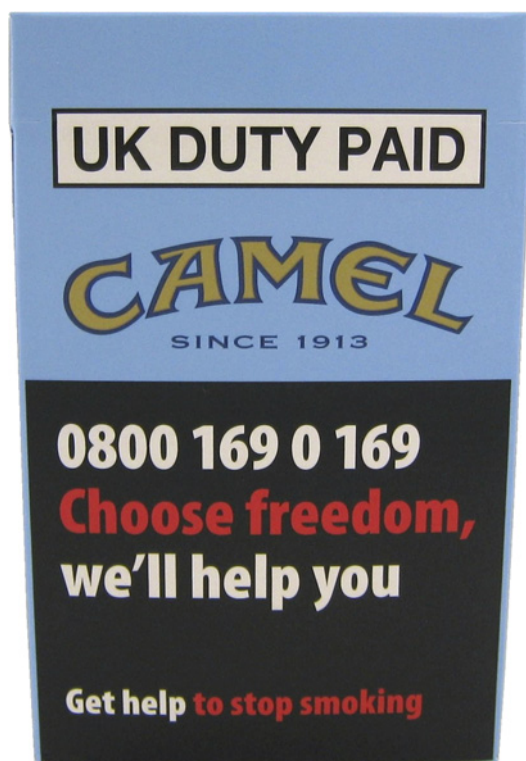
Figure 4 An example of supportive, cessation-oriented messages in the UK (2010).

The evidence also suggests that health warnings can promote smoking cessation and discourage youth uptake. Considerable proportions of smokers report that warning labels increase their motivation to quit and help them to sustain abstinence after quitting, and the use of effective cessation services increases after new health warnings have been implemented (figure 4). However, the impact of health warning labels depends upon their design: obscure text-only warnings appear to have little