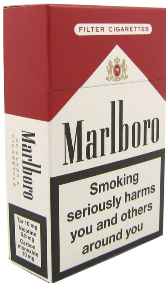
Figure 2 An example of EC/UK text-only warnings (2003).

information processing and improve memory for the health message.