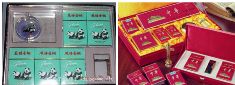
Figure 1 The China National Tobacco Corporation sells Xiongmao ('Panda') brand Collector's Edition packs (left 32 ) and Zhonghua ('China') brand (right 33 ) sets packaged with ashtrays and lighters. They are popular gifts in China. The Chinese domestic brands featured Chinese symbols, such as the panda (left) and the Tiananmen Square marble pillar, an ornamental column located in front of Tiananmen Square (right).

In response to Marlboro's success around Chinese New Year, BAT partnered with BSB China in 1993 to create a plan for 555 to 'own' a festival too. 75 BAT and BSB China considered creating a new holiday, such as 'Bosses Day' (so employees would gift cigarettes to bosses), but decided to 'exploit' the existing Chinese Mid-Autumn Festival, 75 which is celebrated annually with social gatherings when the moon is fullest and roundest. 75 76 The decision to exploit Mid-Autumn Festival culminated in Project